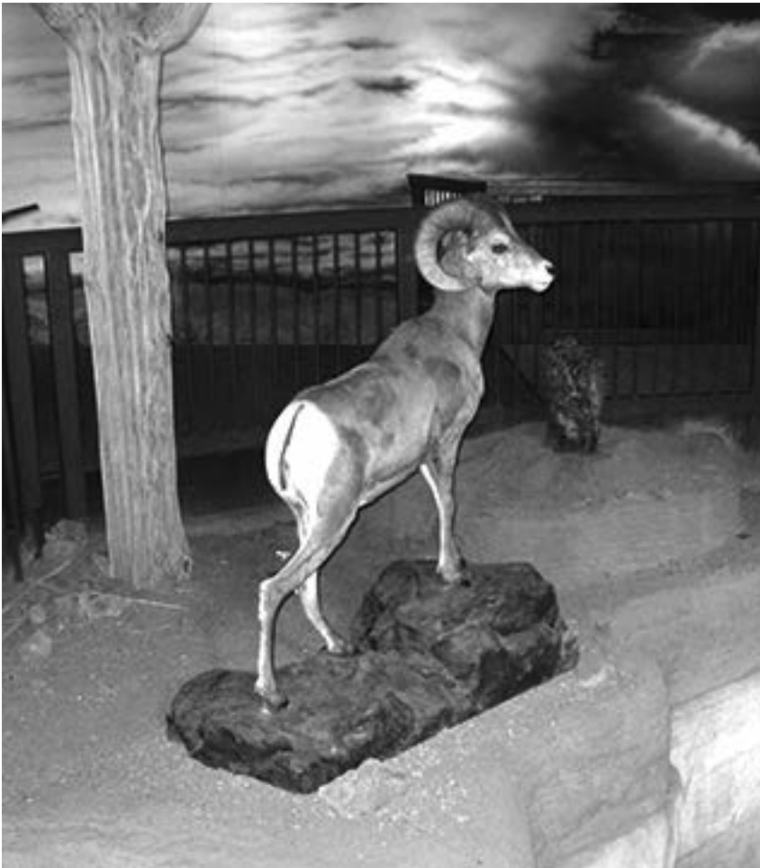
Top: Completed javalina display. Below: Black bear above pond. Left: Big horn sheep