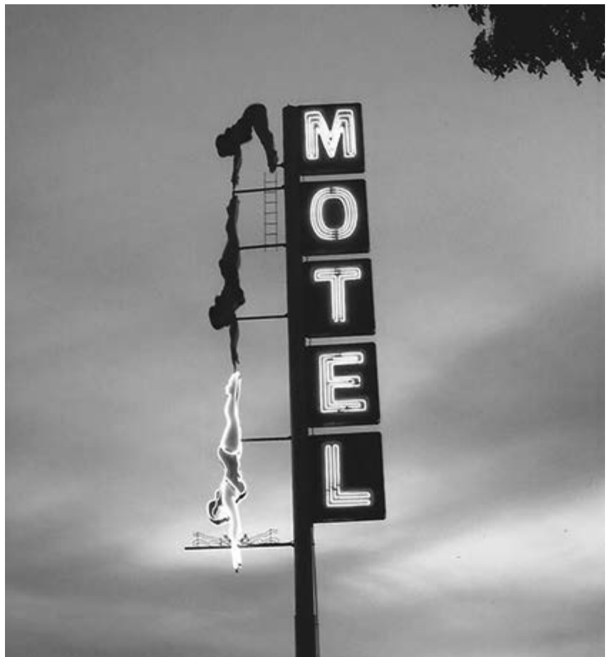
She dives again! Historic neon motel sign is back in action.

Another project of the foundation has been the preservation of the Buckhorn Baths property. The City of Mesa is now negotiating to buy that land.