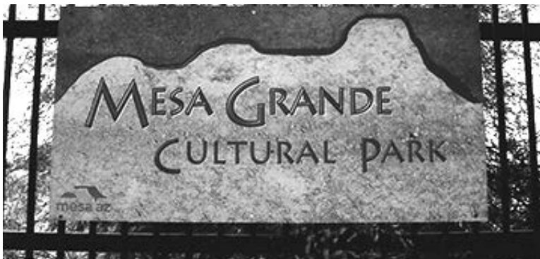
A new sign will greet visitors to Mesa Grande Park

This important part of prehistory is now being shared with the general public so is a new heritage destination rather than "that pile of dirt" on the corner of Date and 10th Street in Mesa. It is now economically viable for the city as well as the museum. SWAT member volunteers have continued to be active at the site and are excited to have been a part of finally having it designated as Mesa Grande Cultural Park.