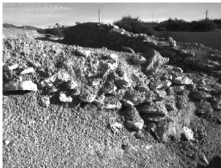
Damage such as this awaits PGM Mudslingers

There are various types of amendments or additives such as cement and several copolymers that have been used by various agencies. The first question to answer is which of these will be most compatible to the wall matrix of the existing structure at a reasonable cost. The amendment we use at Pueblo Grande is a copolymer called SoilShield-LS. We combine it with water to form a